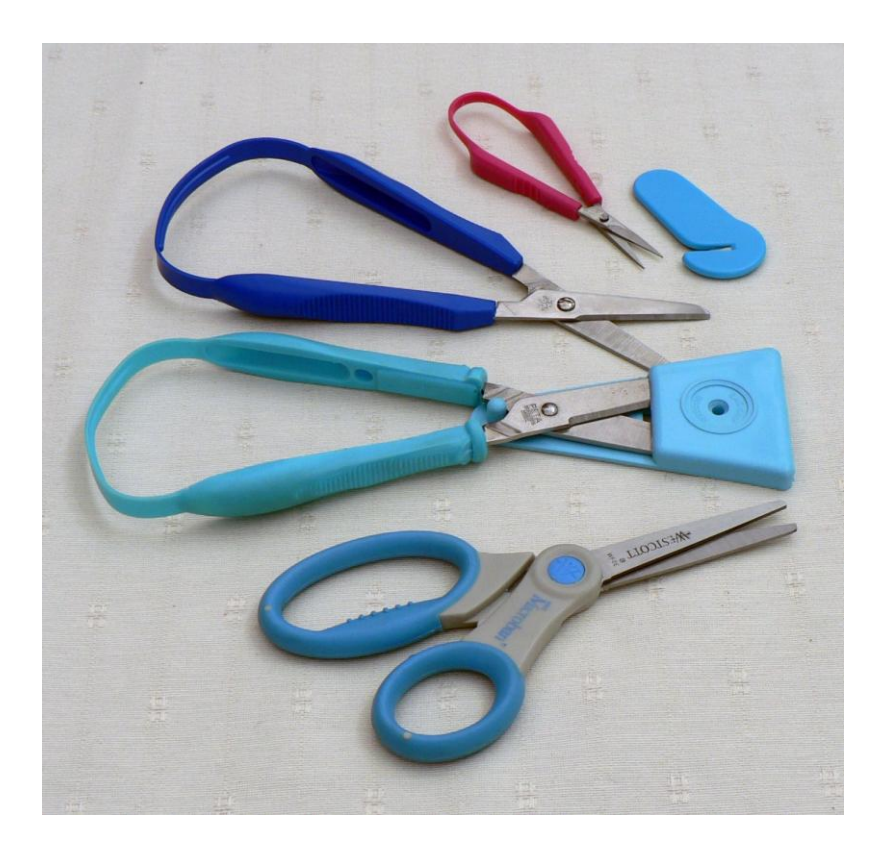
Fig.5 Loop scissors and padded handles for comfort and ease.