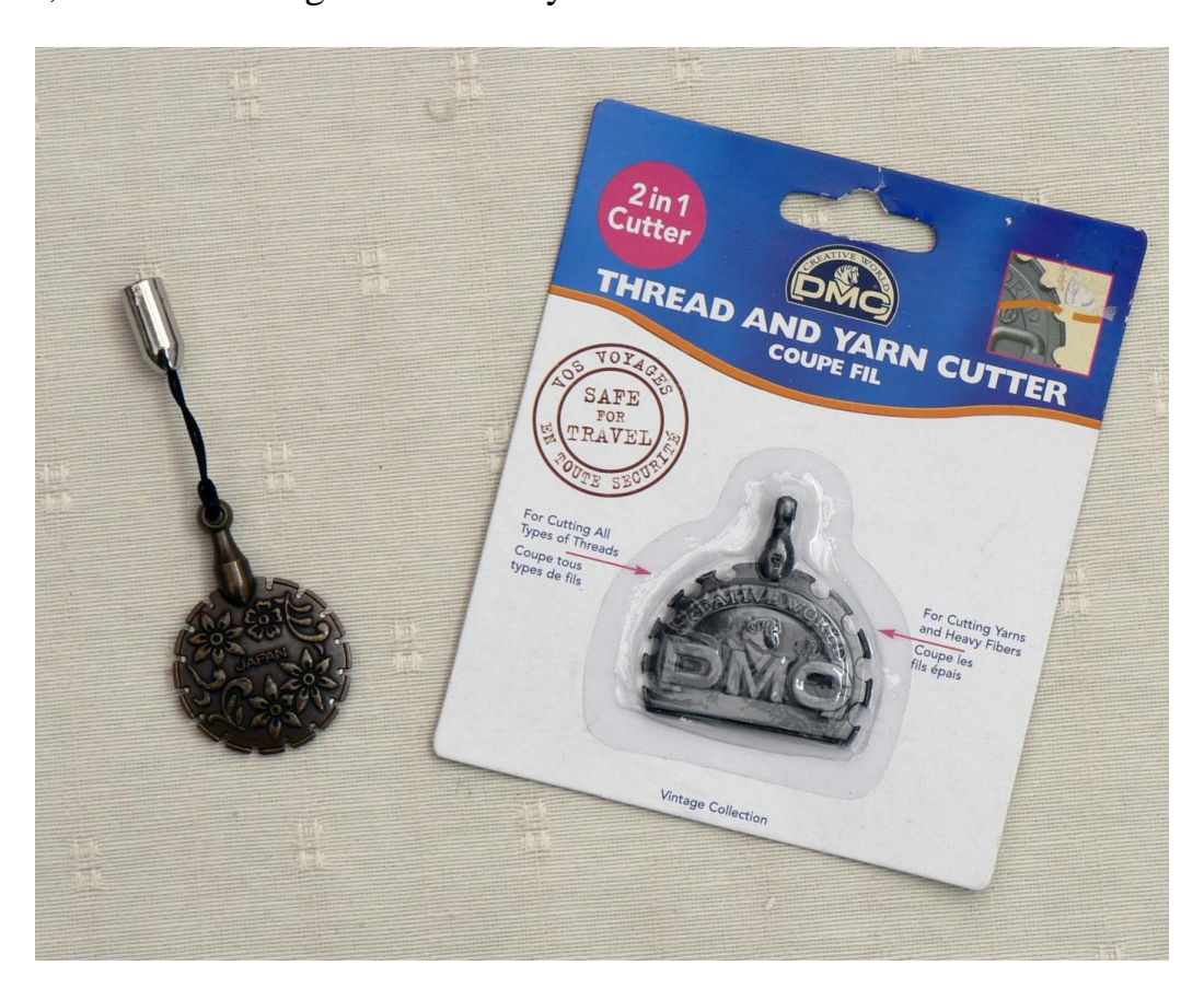
Fig.6 Thread and yarn cutters

The limitations that have now been imposed by most airlines, prevents scissors and cutting tools from being carried on to aircraft and given the thought of having my precious scissors confiscated is unbearable and so on long haul flights, I resort to using a thread and yarn cutter.