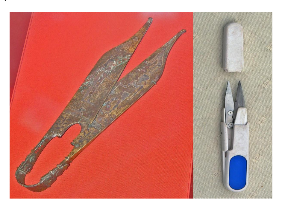
Fig.1 Bronze scissors from the Metropolitan Museum in New York USA thought to be from 2<sup>nd</sup> century A.D. NE Turkey. Modern scissors snips are very similar.

Modern high quality scissors are made of stainless steel and are designed to ensure the blades cut and shear at the exact point where the blades meet. The aim being to cut, not tear the fabric or threads, which is particularly important to the needlewoman and if used with care and properly maintained, they will last for many years.