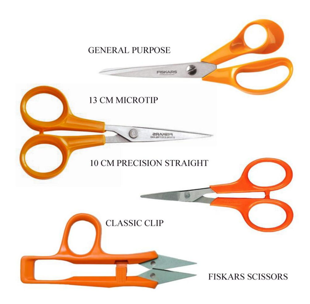
Fig.2 Scissors currently available for needlework

and sometimes, costly mistakes. They should be comfortable to hold with a sufficiently large handle to allow two or three fingers to fit smoothly into the bottom opening and the thumb in the top one, so they can be gripped firmly.