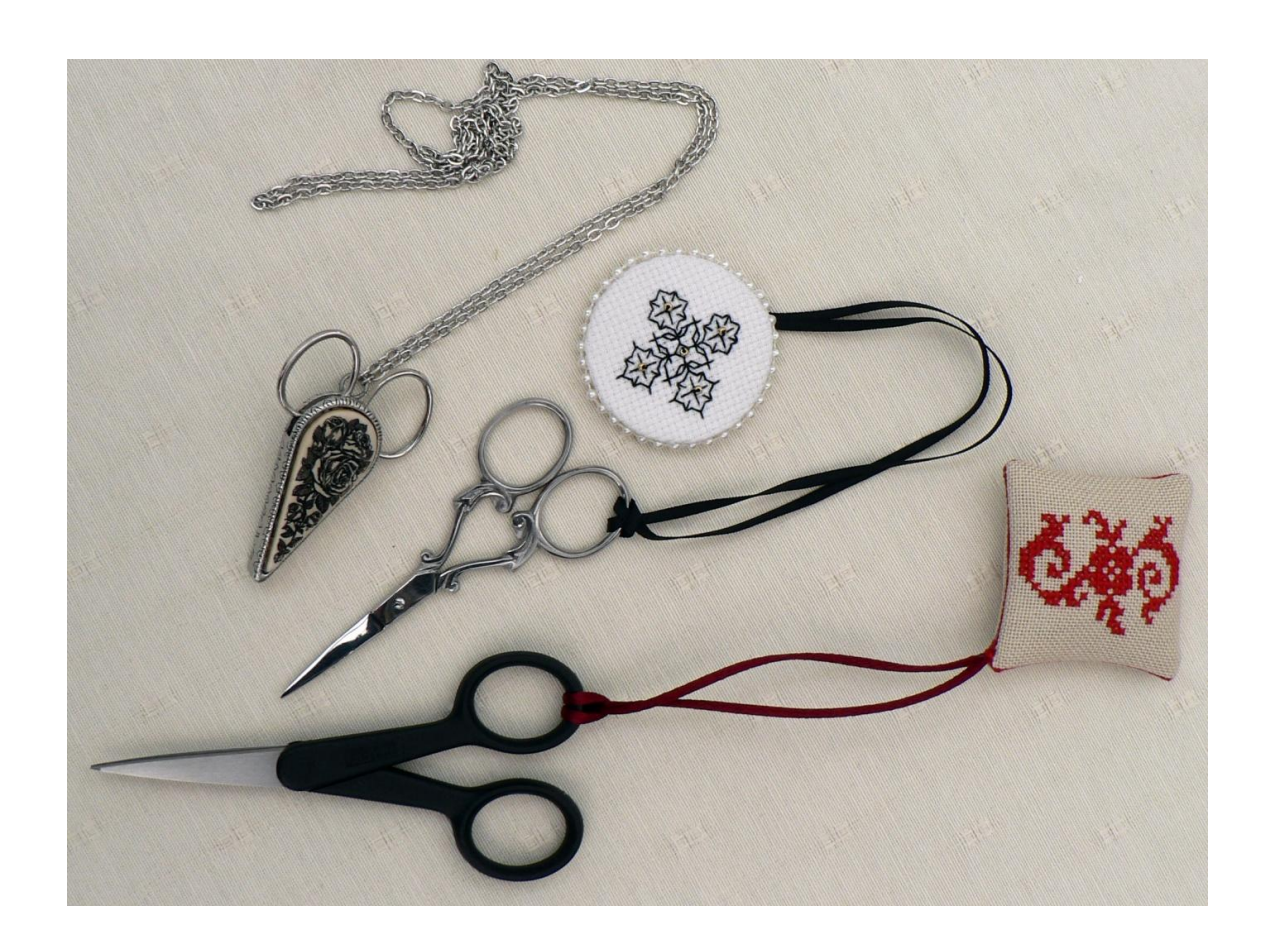
Fig.8 Decorative scissors and fobs make attractive additions to the sewing box

Adding a scissor fob makes small scissors attractive and less likely to disappear down the side of the chair and you may wish to consider making one as explained below.