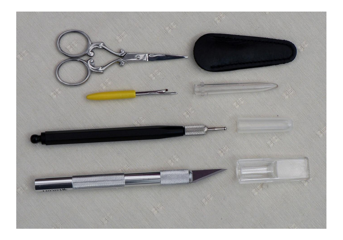
Fig.10 Safety first – all points and blades should be covered after use

Note: To slip stitch together correctly there MUST be the same number of backstitches on each piece of fabric, or they will not match up when stitching!