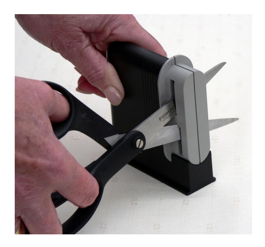
Fig.7 Scissor sharpener

For example, try not to drop your scissors as it can bend the blades or damage the cutting edges. Clean them regularly with a soft cloth and carefully check the blade tension, adjusting the screw as necessary. If the blades are too tight they will grind together. If they are too loose, they will not be aligned correctly.